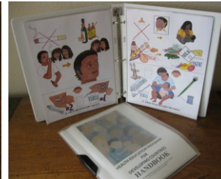
C: Notebook Version