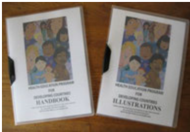
A: Report Cover

See photos. The coil binder version is also produced in a Combined version that includes both the Handbook and the Illustrations in a single volume (B-2). All versions enable the presenter or facilitator to consult the Handbook while simultaneously demonstrating the corresponding Illustration. The combined single volume version (B-2) is currently the most popular (Simply delete the two colored cover pages for the HANDBOOK and ILLUSTRATIONS from the respective online files).