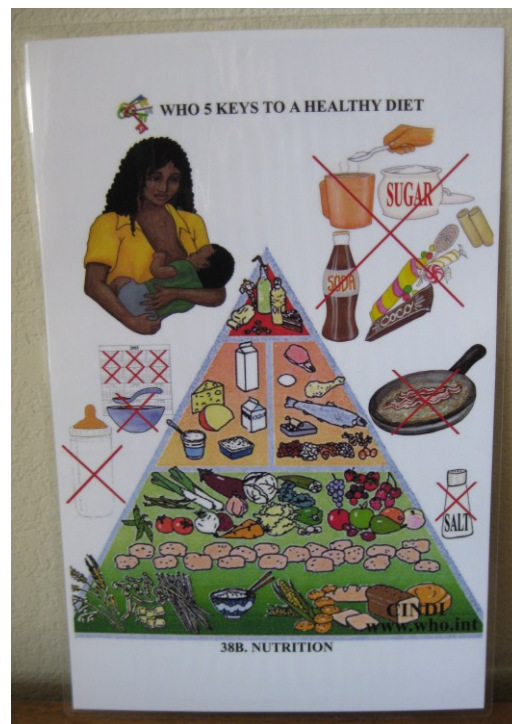
11 x 17 inch Laminated Poster

The 56 illustrations (28 double sided laminated posters) may also be easily made from a CD or flash drive by your local copy or office supply shop usually for $5-$6 per double sided 5 mil laminated poster or about $150 per set. (However, you need not reproduce all 56 Illustrations. You may choose only those that are most important to the community you will be working with.) Office supply shops often have excellent sales.